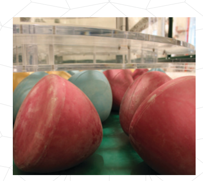
Solids of constant diameter in Coaster

MoMonkeys — Tessellation illustrations with playful primate patterns continue as the denizens of Miles of Tiles and the Mathematical Monkey Mat magnetically climb the MoMath walls in the Tessellation