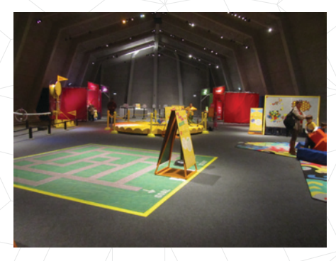
The Math Midway at the Lawrence Hall of

It all started with the Math Midway, but the opening of the MoMath visitor center doesn't mean the Midway will be slowing down. After four months at the Lawrence Hall of Science in Berkeley, California, the Midway relocated to the Museum of Discovery and Science in Fort Lauderdale, Florida, where it will live until Californians get another chance with the show as the Midway rolls into Redding, California in