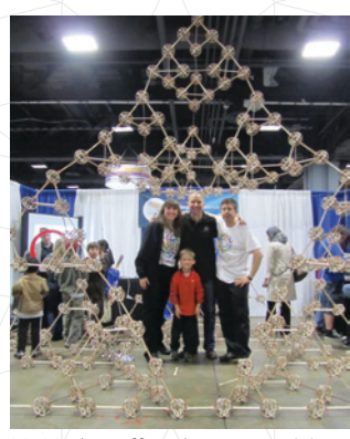
MoMath staff and a young visitor under the Sierpinski tower.

Washington DC. MoMath participated in the USA Science and Engineering Festival, presenting a unique, giant construction toy, Multi-Morphing Megaplex. Visitors delighted in creating