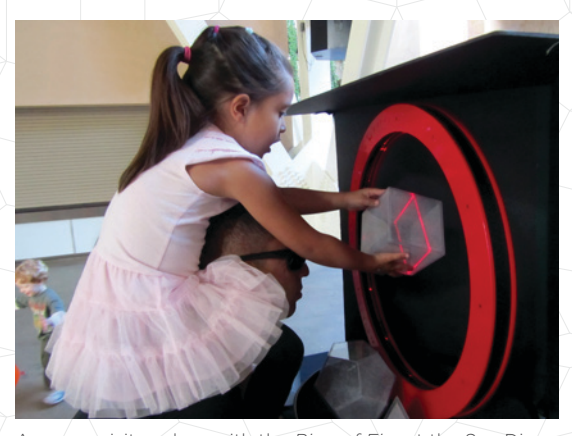
A young visitor plays with the Ring of Fire at the San Diego Festival of Science and Engineering.

After a successful launch at several science festivals around the nation. MM2GO made its academic debut at the Carle Place Middle School/High School on Long Island, thanks to the sponsorship of the County Nassau Mathematics Teachers Association (NCMTA). During the NCMTA's 2012-2013 kickoff meeting,