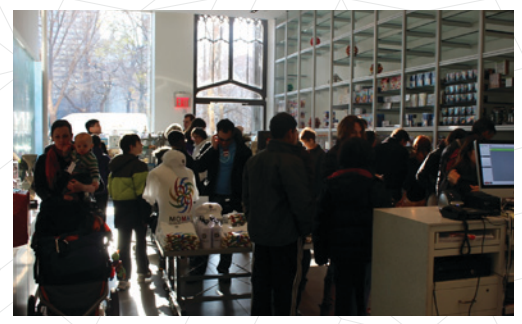
Shoppers check out the selection at Additions.

Another exciting development at 11 East 26<sup>th</sup> Street was the opening of Additions , MoMath's shop and Manhattan's newest store dedicated to mathematical puzzles, games, books, and gifts. Additions is the go-to place for puzzles, t-shirts, jewelry, and even infant bodysuits, all with a mathematical twist.